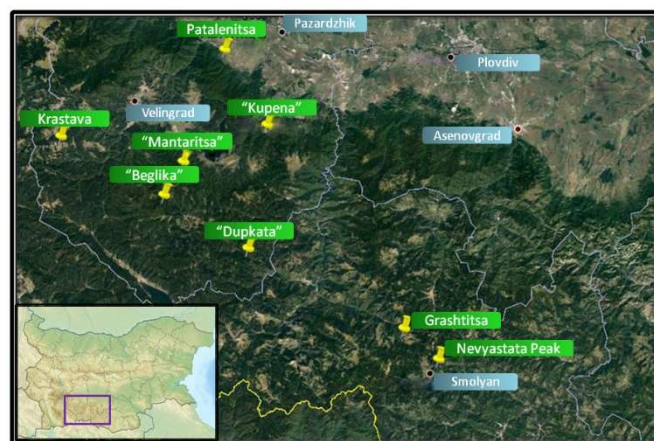
Figure 1. Map of the Western Rhodope Mts. with the main towns (in blue) and the sampling sites, where pitfall traps were set (in green).

The systematic list follows Kryzhanovskij et al. (1995).