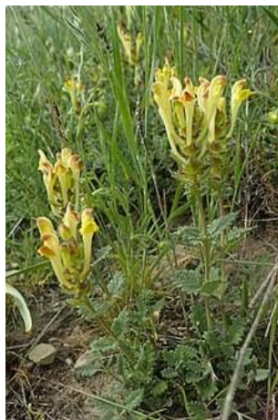
Figure 1. Scutellaria orientalis L. subsp. virens (Kotchy & Boiss.) J. R. Edm. during flowering.