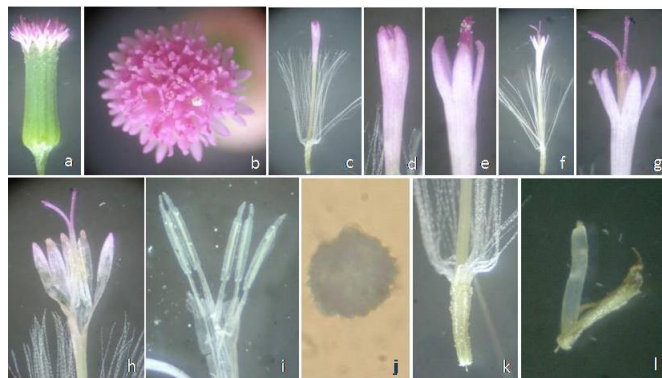
Figure 2. Emilia sonchifolia : a. Anthesing capitulum, b. Top view of anthesed capitulum, c-g. Different stages of anthesis of disc floret, h. Relative positions of stylar arms and syngenesious anthers, i. Dehisced anthers, j. Pollen grain, k. Ovary, l. Ovule.

style inside the corolla tube. The style with its aligned stylar arms extend beyond the height of anthers; the stylar arms stand almost erect and diverge partially exposing the inner hidden stigmatic surfaces.