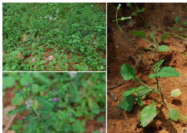
Figure 1. Emilia sonchifolia : a. Habit, b. Flowering capitula, c. Individual plant with capitula.

The plant is an annual straggling herb that grows primarily in sunny or slightly shaded moist cultivated and undisturbed localities (Figure 1a).