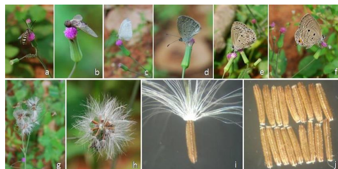
Figure 3. Emilia sonchifolia : a. Campsomeris annulata , b. Eristalinus sp. , c. Pierid, Catopsilia pomona , d-f. Lycaenids - d. Zizula hylax , e. Chilades laius , f. Chilades pandava , g-h. Seed dispersal, i. Seed with pappus, j. Seeds.

The capitulum is the unit of attraction for the insects. Insects visiting the capitula consist of wasps, flies and butterflies and all foraged for nectar only (Table 2). Wasps and flies, each represented by a single species; the wasp is the Scoliid, Campsomeris annulata (Figure 3a), the fly is the Syrphid, Eristalinus sp (Figure 3b). The butterflies are represented by 1 pierid species ( Catopsilia pomona -Figure