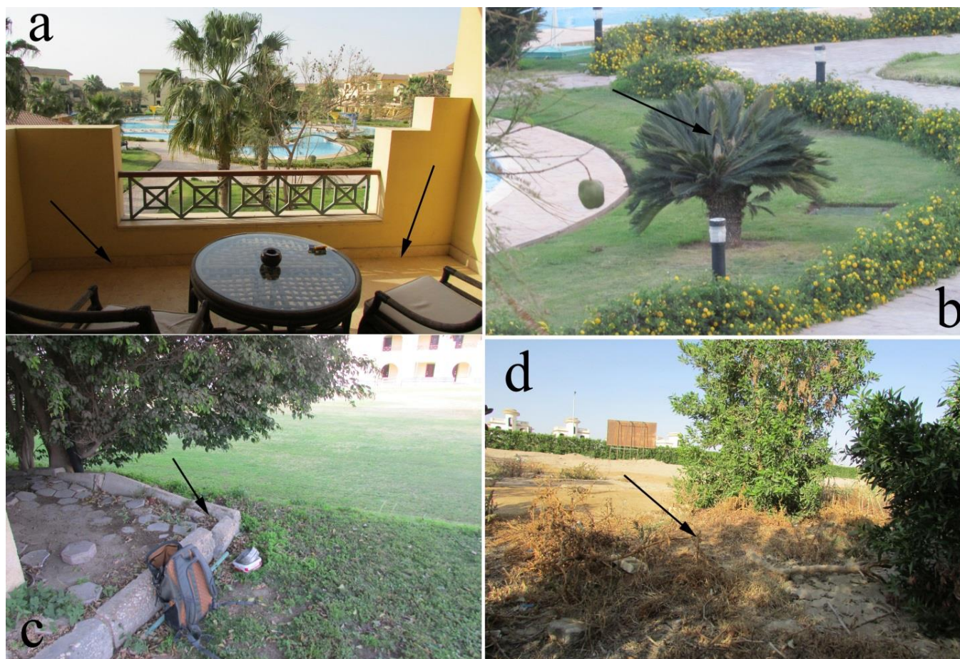
Figure 1. Views from the habitats surveyed: a - locality of Lachesilla pedicularia , L. quercus , L. bernardi and Ectopsocus vachoni ; b - locality of L. quercus ; c - locality of Trichopsocus dali , d - locality of Liposcelis decolor .