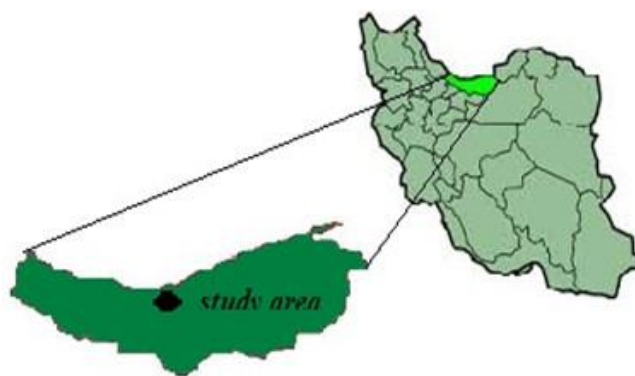
Figure 1. Location of the study area in the Mazandaran province, north of Iran.

(200×200m) were selected for each stand. In order to decrease the border effects, surrounding rows of stands were not considered during sampling. Soil sampling was dug along the four parallel transects in the central part of each afforested stand. Soils were sampled to a depth of 30 cm in all plantations during the summer time using a 7.6 cm diameter core sampler (n = 16 cores/stand using a randomly systematic method) taken at 0-15 and 15-30 cm depths. The same sampling procedure was carried out also for the control area (covered by sparse herbaceous species including Urtica dioica , Sambucus ebulus , Graminae , Ruscus sp.).