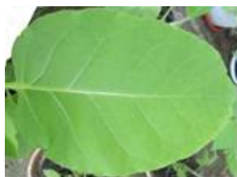
Figure 1. Healthy tobacco plant cv. Samsun NN.

Until the 7 th day after inoculation with PVY virus control tobacco plants cv.Samsun NN (inoculated with PVY only and not treated) remained symptomless and healthy (Figure 1). The DAS-ELISA values of these plants remained under the cut off, with values around 0.277 (Table 1). Visible symptoms of PVY infection were observed after the 14 th day consisting of chlorotic and necrotic patterns and leaf deformation (Figure 2).