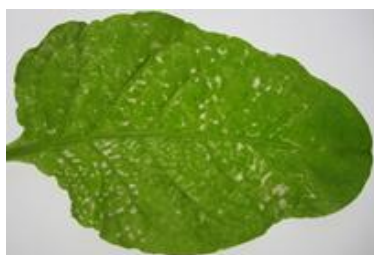
Figure 2. Mosaic and necrotic symptoms of tobacco plant cv. Samsun NN inoculated with PVY.

Plants were treated with different % water dilution of sukomyacin from 0.01% to 20%. Water dilutions from 0.01 to 6% did not reduce enough DAS-ELISA values of PVY and they remained above the cut off, ranging from 3.000 to 0.816 (Figure 5, Table 1). However, treatment with 1% water dilution of sukomyacin reduced development of virus symptoms significantly. Treatment under 1% of sukomyacin had no effect on the virus infection in the tested tobacco plants (Figure 5). 3% of sukomyacin reduced the DAS-ELISA values from 3 to 1 (Figure 5). Ten and twenty % sukomyacin reduced the DAS-ELISA values of PVY under the off and plants were symptomless and considered virus free (Figure 5, Table 1).