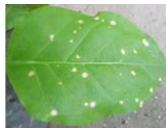
Figure 3. Necrotic symptoms of tobacco plant cv. Samsun NN inoculated with ToMV.

ToMV was completely different plant virus from PVY and tobacco plants reacted differently. Until the 2 nd day after inoculation with ToMV virus control tobacco plants (inoculated with ToMV only and not treated) remained symptomless and healthy (Figure 1). The DAS-ELISA values of these plants remained under the cut off, with values around 0.297 (Table 1). Visible symptoms of ToMV infection were observed after the 3 rd day consisting of small necrotic spots on the leaf lamina (Figure 3).