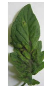
Figure 4. Necrotic symptoms of tomato plant cv. Ideal inoculated with PVY.