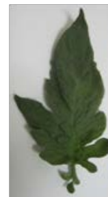
Figure 1. Healthy tomato plant cv. Ideal.

Unlike PVY, CMV virus control tomato plants (inoculated with CMV only and not treated) remained symptomless and healthy until the 21st day (Figure 2). The DAS-ELISA values of these plants remained under the cut