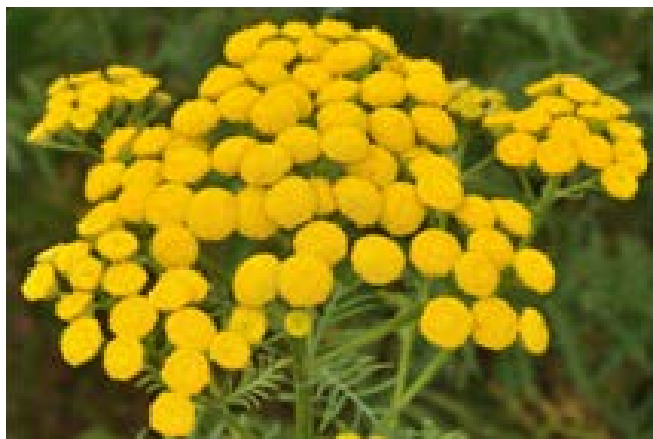
Figure 1. T. vulgare .

pharmacological qualities. It can be cultivated and it is used in companion planting, for biological pest control and sustainable agriculture. Tansy is planted alongside potatoes to repel the Colorado potato beetle. According to findings of Scheerer (1984), tansy reduced beetle populations by 60-100%.