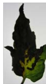
Figure 5. Necrotic symptoms of tomato plant cv. Ideal inoculated with PVY and CMV.

off, with Mean value 0.305 (Table 1). Visible symptoms of CMV infection were observed after the 21th day such as leaf mosaic and chlorosis (Figure 3).