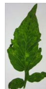
Figure 3. Necrotic symptoms of tomato plant cv. Ideal inoculated with CMV.