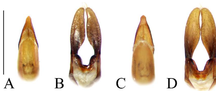
Fig. 3. Male genitalia of Vadonia unipunctata from Bulgaria. A, B – apex of penis and parameres of V. unipunctata makedonica , Beslen locality, 05.vi.2021; C, D – apex of penis and parameres of V. unipunctata unipunctata , Potsarnentsi locality, 20.v.2020. Scale bar: 1 mm.

The studied population of V. unipunctata from Potsarnentsi Vill. has the characters of the nominative subspecies – reddish-yellow elytra with black spot in the middle of each elytron (Fabricius, 1787; Vartanis, 2023), moderately long erect golden-yellow to light brown pubescence of the pronotum and the basal third of the elytra (this pubescence is very long and recumbent in V. unipunctata bulgarica ), 5th antennomer clearly longer than 4th and 6th (as long as 4th and 6th in V. unipunctata bulgarica ) as well the usual for V. unipunctata anteriorly widened black sutural elytral line (Danilevsky & Vartanis, 2015; Danilevsky, 2020; Vartanis & Resl, 2023).